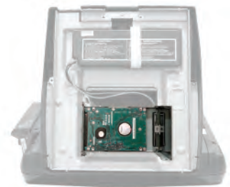
Built-in removable 2.5" HDD in base stand