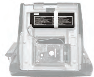
Optional built-in battery