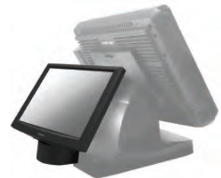
Rear mount bracket for optional 2nd display (LM6101C)